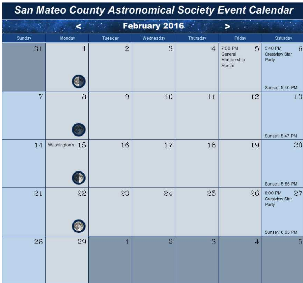
San Mateo County Astronomical Society Event Calendar from the Night Sky Network.