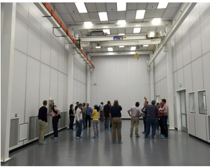
Preparing for entering the LSST Clean Room.