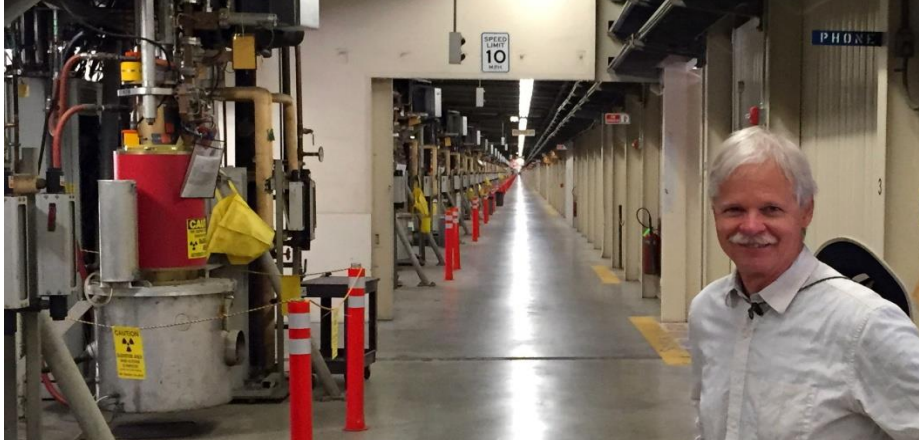
The Klystron Gallery.