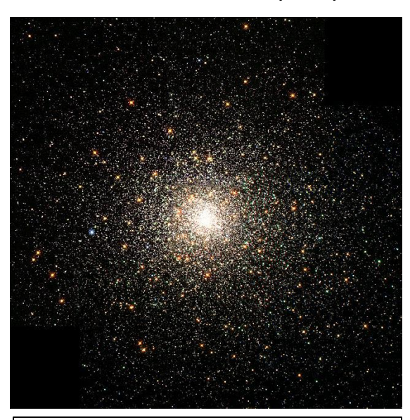
M80 Globular Cluster photographed from the Hubble telescope.

Subsequent deeper examination of the component stars show most of them to be older stars of 11-13 billion years old, often lacking much in the way of heavier chemical elements present in younger stars. This is what would be expected for objects formed in the early Universe soon after the Big Bang before heavier elements existed in much abundance. There are also only around 150-180 of these objects found around the Milky Way in contrast to there being thousands of more recently formed open clusters whose stars are often rich in heavier elements synthesized in previous generations of older stars