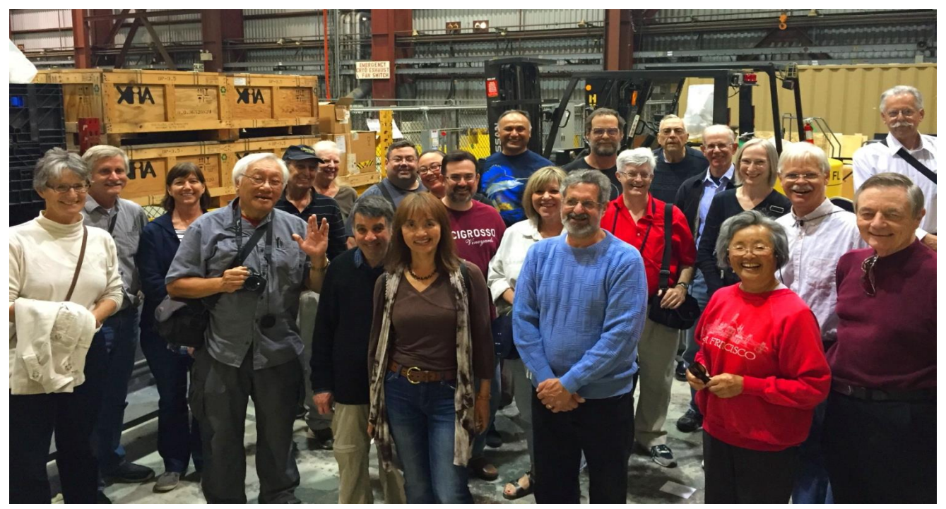
Group photo in the Collider Experiment Hall.