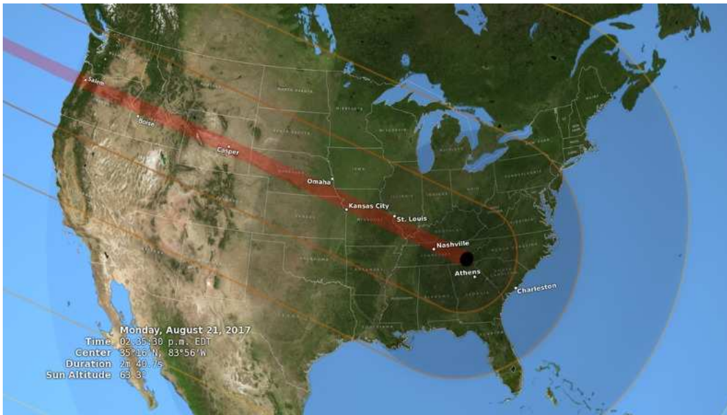
Illustration showing the United States during the total solar eclipse of August 21, 2017, with the umbra (black oval), penumbra (concentric shaded ovals), and path of totality (red) through or very near several major cities.

While the sun's surface is ~9980 Fahrenheit (~5800 Kelvin), the corona can reach several millions of degrees Fahrenheit. Researchers have proposed