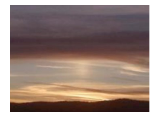
Right: a Sun pillar. Below left: cloud iridescence. Below right: green flash above the Sun at sunset.